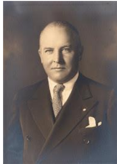
Past Post Cdr.

(**As can be seen by the picture a good time was had by all M.V.F. Members and the Volunteers).